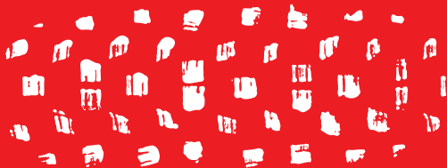
Zleen Racerunner Radical 29 x 2.25 R