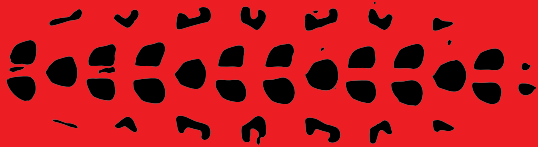
Zleen Leopard Pro Tubeless 29 x 2.25